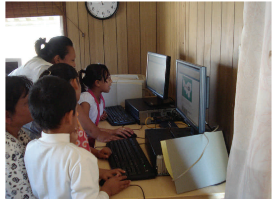
Students and parents are learning about reading through the Oases of Literacy Project .

The District Rotary Foundation Committee for 2013-16 has been selected. They are District